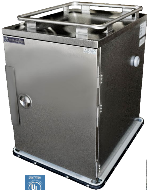
Can replace panel with removable heater